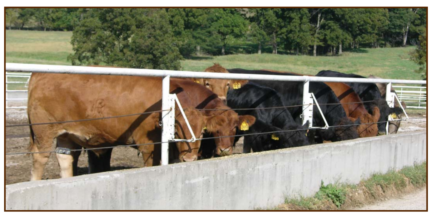
Be a smart bull buyer and don't buy Johne's disease. Only purchase bulls from low-risk or test-negative herds. At minimum, purchase animals only from herds with a known Johne's disease status.

... A calf can suck on or lick a manure-contaminated gate or fence or equipment such as a bucket and ingest enough MAP to infect it if the item has been contaminated with MAP-infected manure. Just a little bit of MAP-infected manure can cause a calf to become infected.